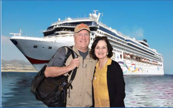
7 DAY GREEK ISLES FROM VENICE 2017